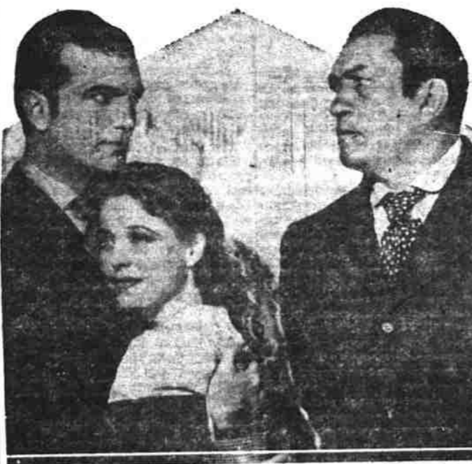
ADVENTURE IN AFRICA—A drama of the lawless days following upon the discovery of diamonds in South Africa is unfolded in "Diamond Frontier," the Queen theatre's offering for today and Monday. John Loder, Anne Nagel and Victor McLaglen are the featured players.

SUNDAY-MONDAY RITZ —"North West Mounted Police," with Gary Cooper, Madeleine Carroll, Paulette Goddard and Preston Foster. LYRIC —"Rangers Of Fortune," with Fred MacMurray and Patricia Morison. QUEEN —"Diamond Frontier," with Victor McLaglen and John Loder. TUESDAY RITZ —"Father Is A Prince," with Grant Mitchell; also, "A Little Bit Of Heaven," with Gloria Jean and Nan Grey. LYRIC —"The Great McGinty," with Brian Donlevy and Akim Tamiroff. QUEEN —"Phantom Submarine," with Anita Louise and Bruce Bennett. WEDNESDAY-THURSDAY RITZ —"South Of Suez," with George Brent and Geraldine Fitzgerald (also playing for New Year's Eve midnight matinee Tuesday). LYRIC —"Saps At Sea," with Stan Laurel and Oliver Hardy. QUEEN —"The Great Plane Robbery," with Jack Holt (also playing for New Year's Eve midnight matinee Tuesday). FRIDAY-SATURDAY RITZ —"Foreign Correspondent," with Joel McCrea and Laraine Day. LYRIC —"Fargo Kid," with Tim Holt (Friday only). Saturday, John King in person on the stage. On the screen, this same star in "Trail Of The Silver Spur." QUEEN —"Stage Coach War," with William Boyd.