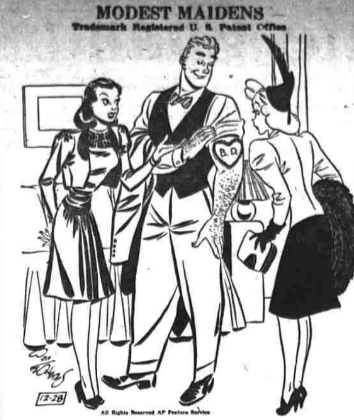
"Look what Butch gave ME for Christmas!"

PORT WORTH, Dec. 28 (AP)—(US Dept. Agr.)—Cattle salable 200; calves 100; today's trade nominal. Week's tops: Mature beef steers 10.50; yearlings 11.00; heifers 10.25; beef cows 6.75; bulls 6.00; slaughter calves 9.00; stock steer calves 10.00; stock heifer calves 9.00; yearling stock steers 9.00; stock cows 6.50. Hogs salable 700; top 6.75 for most good and choice 190-300 lbs. averages; choice 150 lb. weights down to 6.00. Sheep salable none. For week, most woolled fat lambs 8.50 down; choice grades quoted at 8.75; woolled yearlings 7.50-7.75; 2-year old wethers 6.75 down; aged wethers 5.00 down; feeder lambs 6.50-7.50. Bull Stages Blitzkrieg HOUSTON, Del. (UP) — Houston's 295 residents have experienced a three-hour "Hitler blitzkrieg" Hitler, a black bull owned by W. E. Simpson, broke loose and charged into town, sending residents scurrying for shelter and demolishing shrubs, small trees and other objects, before being subdued.