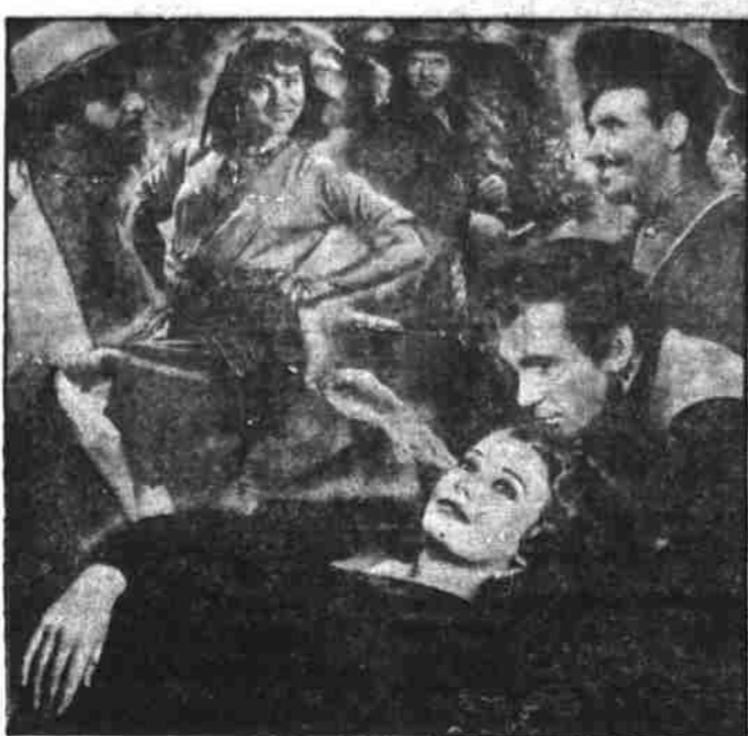
THE DEMILLE SWEEP—Latest of the Cecil B. DeMille sagas of adventure and heroism is a saga of the great Northwest, "North West Mounted Police," which headlines the Ritz theatre's program for today and Monday. Stellar players in the production, seen in this montage photo, include Gary Cooper, Madeleine Carroll, Paulette Goddard, Preston Foster, Robert Preston, Akim Tamiroff and George Bancroft.

Advance information on the picture, indicates that Albert Dekker, who had the title role in Dr. Cyclops, delivers one of the most important supporting performances in the picture as a pugilistic cowboy who trades left-hooks with lead bullets, and wins. For Gilbert Roland, who plays a smiling, shooting Mexican, with an irresistible romantic appeal, "Rangers of Fortune" has been nominated as his new bid for screen stardom.