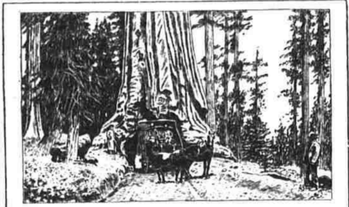
WASHINGTON! BIG TREE MARIPOSA GROVE, CALIFORNIA—WHO HAS NOT HEARD OF THE "BIG TREES" OF CALIFORNIA? THEY ARE ANOTHER PROOF OF THE FACT THAT THE WESTERN PORTION OF OUR COUNTRY IS A REGION ABUNDANTLY ENDOWED BY NATURE.