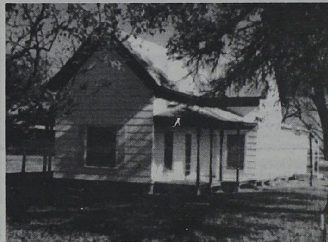
Beautiful house being moved to new location, south of Carbon.

Change is fast approaching with the year 2000 almost here--then again some things deep in the heart of goodness never change. A new beginning for a house built almost a century ago is exciting and of interest to a number of local people.