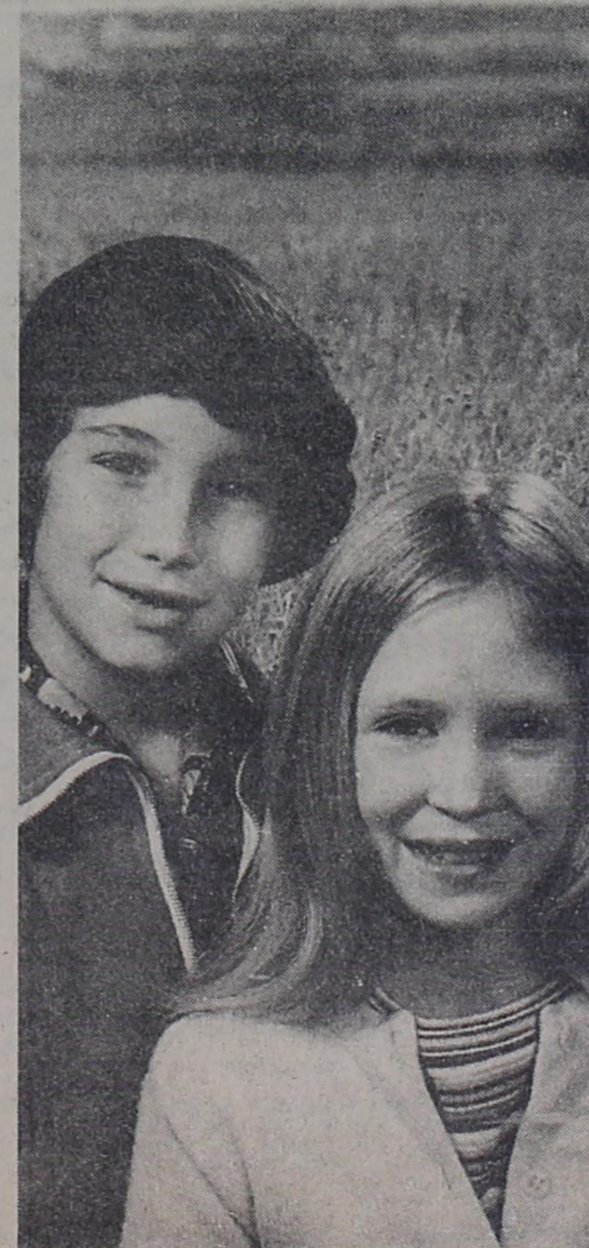
The electricity these youngsters will need when they grow up for homemaking, jobs, education, health care and cleaning up the environment - must be planned for today.