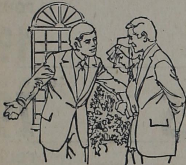
There Is Comfort In Knowing All Is Attended To Your Satisfaction