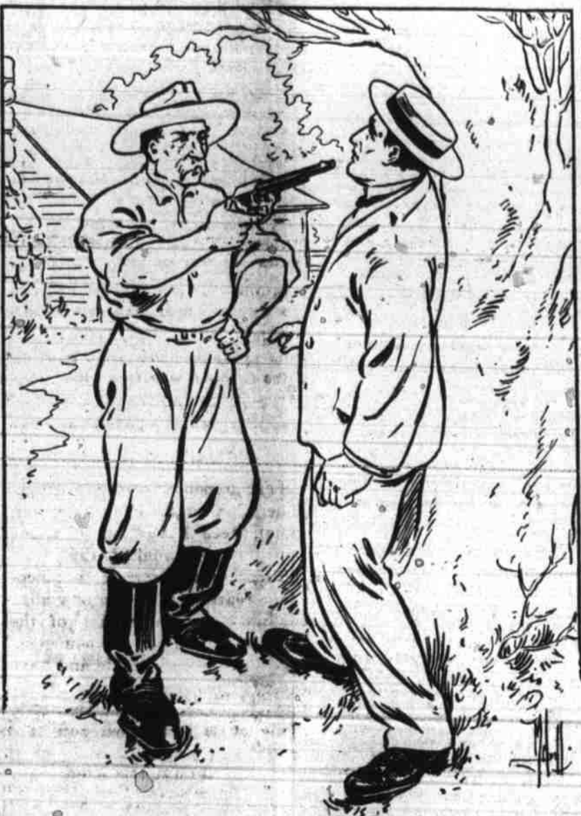
"I Reckon You Have Some Idee What a Hoss Thief Gits in This Neck o'

ry was looking into the face of a big. | feet. "The shurf'll soon tell," and raw-boned man of middle age. What do you want?" the householder asked, eying the new-comer very closely.