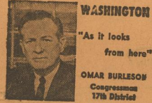
WASHINGTON "As it looks from here" OMAR BURLESON Congressman 17th District

WASHINGTON, D. C. — THIS IS A SPECIAL TIME TO PAUSE and take stock—something like a retail store taking inventory after the first of the year. It is a time to see if "our cup runneth over."