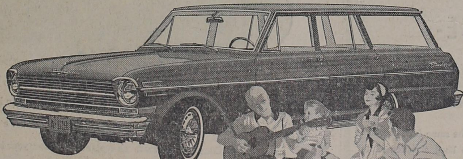
NEW CHEVY II NOVA STATION WAGON

From snappy interiors to sure-footed seat, this one's got the gift of making sport of most any trip.