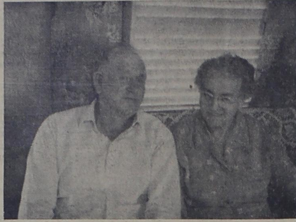
Continued from Page One

no knowledge of how to stop, he came right through the barnyard gate before he could choke it to a halt.