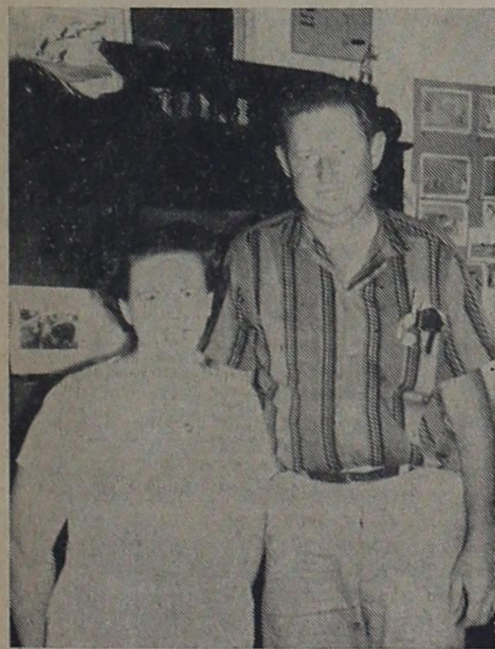
A HAPPY COUPLE — Recently the editor of the Weatherford Herald sent us the following information.

The American Guernsey Cattle Club is a non-profit agricultural registry organization serving some 40,000 purebred Guernsey breeders from coast-to-coast.