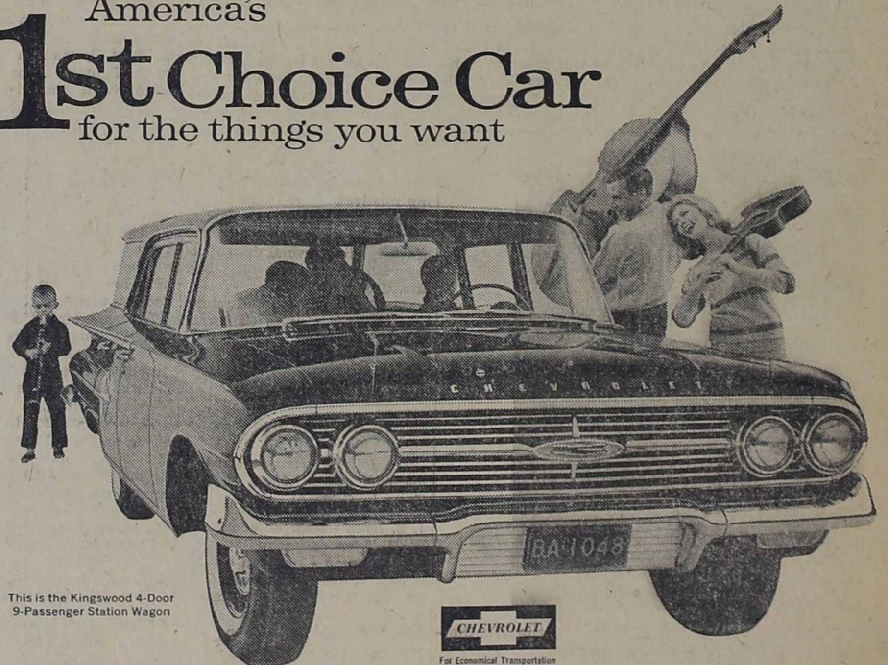
This is the Kingswood 4-Door 9-Passenger Station Wagon