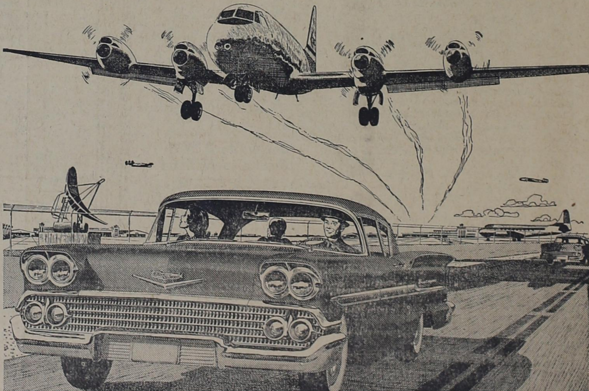
The Biscayne 2-Door Sedan with Body by Fisher. Every window of every Chevrolet is Safety Plate Glass