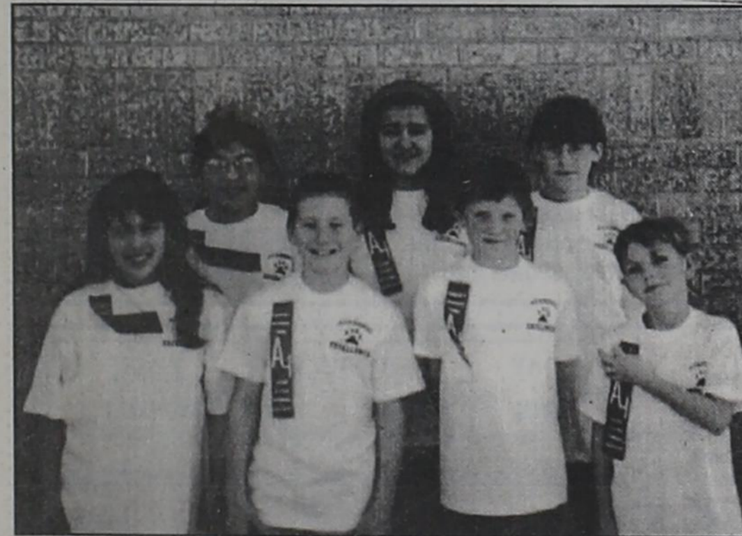
THIRD - FOURTH - FIFTH - SIX GRADES