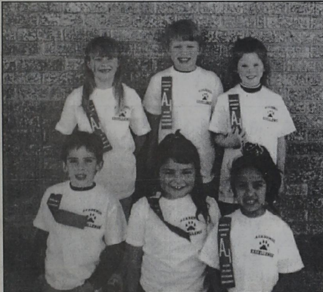
KINDERGARTEN - FIRST GRADE - SECOND GRADE