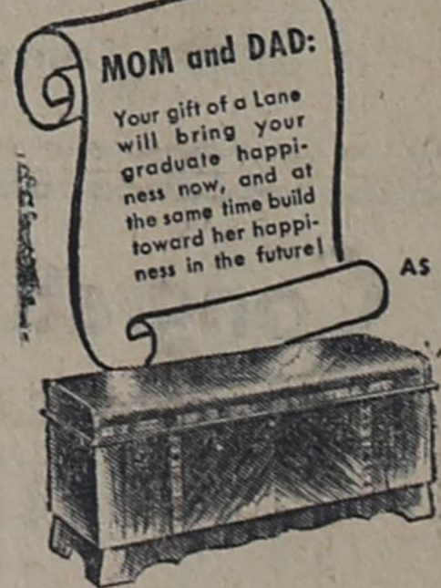
Streamlined modern model in American walnut—equipped with self-rising tray. $49.95

ONE GARMENT SAVED FROM MOTHS PAYS FOR A LANE!