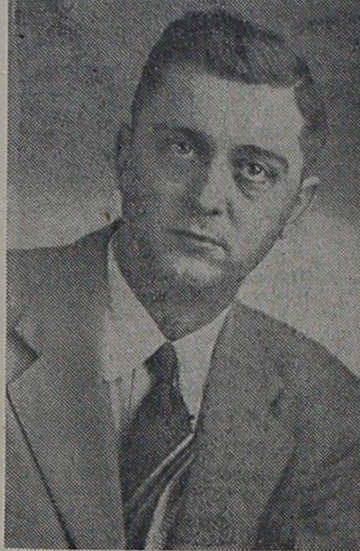
TO THE CITIZENS OF EASTLAND COUNTY