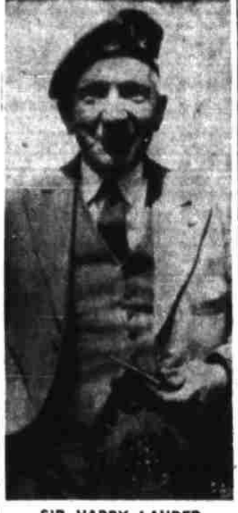
SIR HARRY LAUDER

PITTSBURGH, Feb. 27. (AP)—Striking coal miners stuck to their "no contract no work" walkout today with the nation's economy groggy for lack of fuel.