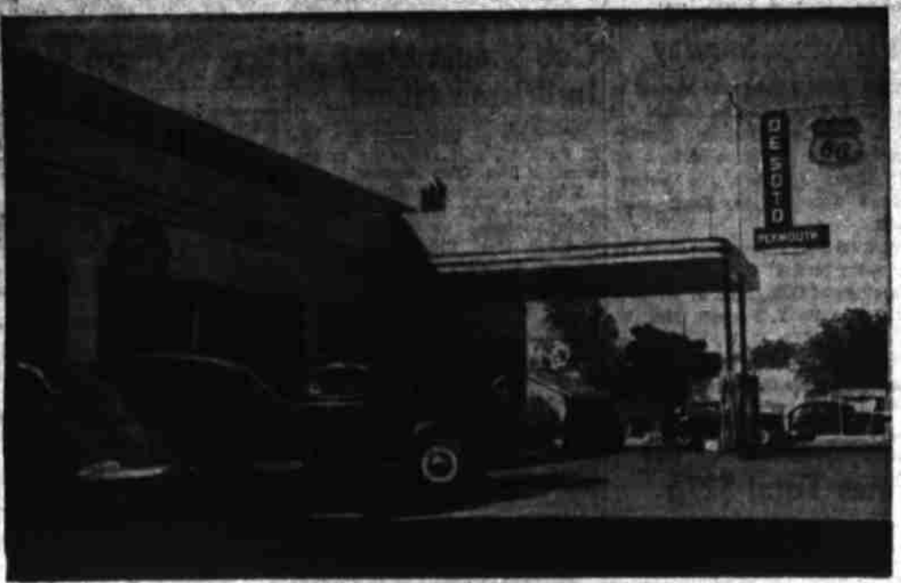
HOME OF SERVICE —From 6 a.m. to 10 p.m. Clark Motor company is open at 215 East Third street for accommodation of almost any need a motorist faces. In addition to gasoline, oil, battery service and the like, washing and greasing services are available, plus general auto repair. Clark Motor company is dealer here for DeSoto and Plymouth automobiles, and also stocks the famed Johnson Seahorse outboard motors.