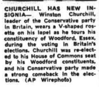
CHURCHILL HAS NEW SIGNIA—Winston Churchill, leader of the Conservative party in Britain, wears a V-shaped rosette on his lapel as he tours his constituency of Woodford, Essex, during the voting in Britain's elections.