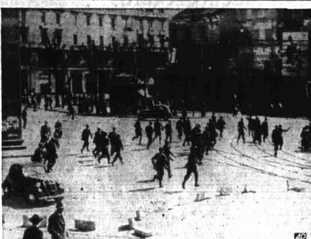
POLICE CHARGE DURING MILAN RIOTING — Riot police charge across Milan's Porta Romana during a battle preceding the call for the 12-hour general strike throughout Italy. Stone roadblocks were laid by the demonstrators to hinder police riot cars. This scene preceded the violence throughout Italy which resulted in one death, hundreds injured and a roundup of demonstrators. Violence continued in San Severo where at least 18 were injured.