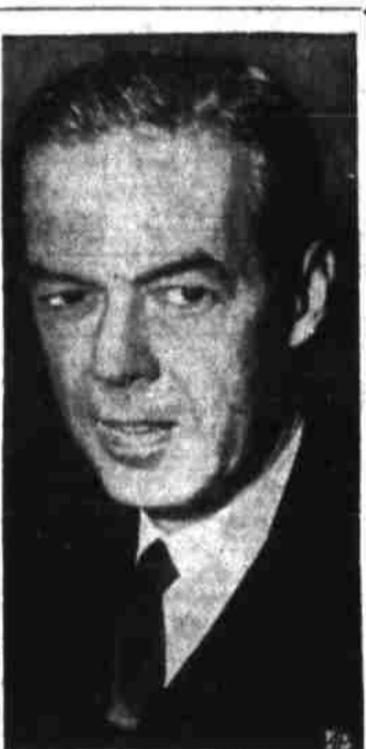
NOMINATED — Thomas E. Murray (above), New York engineer, was nominated by President Truman to fill the vacancy on the Atomic Energy Commission created by the resignation of chairman David E. Lillenthal.

Individuals who have vehicles that have been registered out of the state and who are now making Texas their home need to provide proof of ownership when applying for tags here. Some states do not require certificates of title. In such cases, a bill of sale will suffice.