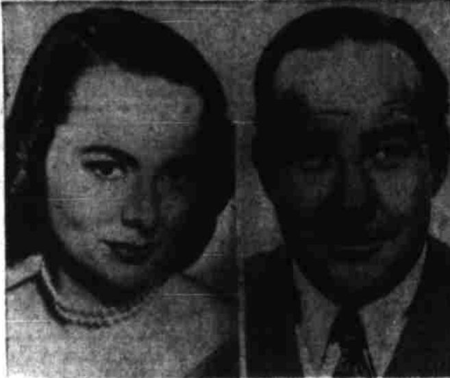
ACADEMY AWARD WINNERS — Olivia De Havilland (left) and Broderick Crawford (right) took top honors in the 1949 award of "Oscars," symbolic of the best movie work of the year. Miss De Havilland's role in "The Heiress" and Crawford's part in "All the King's Men" gave them first choice when awards were made at the Pantages Theater, Hollywood, Calif.

Cecil B. De Mille was cited for his 37 years of creating film epics. Despite the fact that he has long noteworthy. One went to Fred Astaire.