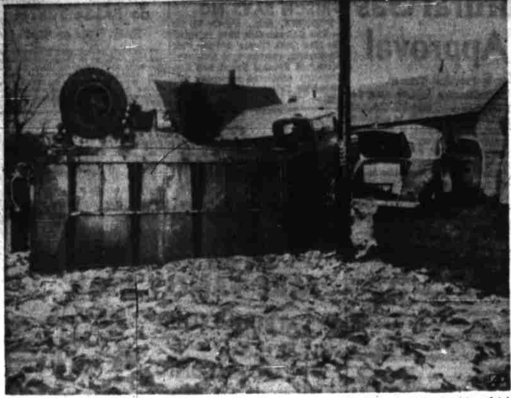
FISH COVERS HIGHWAY AT CRASH SCENE - Trailer section of the 16-ton truck involved in a fatal accident at Freetown, Mass., is shown after it overturned spilling hundreds of pounds of fish on the