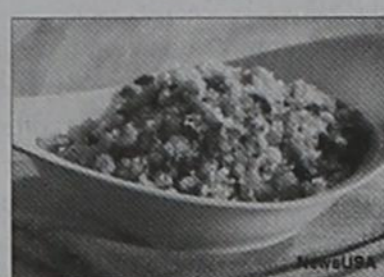
Health tip: add California Raisins to your next salad.

hours of TV each week. Try putting a treadmill in front of the screen, jump rope, or march in place during half of your TV-watching time. Even brief bouts of activity improve cardiac risk.