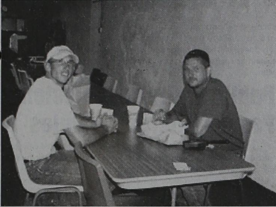
We offered delivery or you could come sit in the cool and eat.

Things are progressing with the park project. Gorman GROW and the EDC held a fundraiser hamburger lunch last week and did well. We raised several hundred dollars. That will go toward playground equipment. The decorative street lamps have been ordered and will be installed hopefully before the Peanut Festival, but they not able to promise installation by that date, but we can be hopeful.