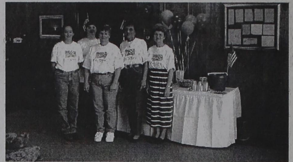
PRE JULY 4TH PARTY — The Girls at American State Bank recently had a small reception for customers at the bank during business hours on Tuesday. They had cookies, punch and popcorn.