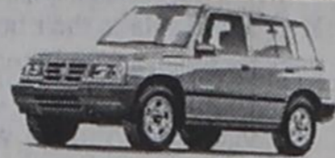
Geo Tracker 4-Door