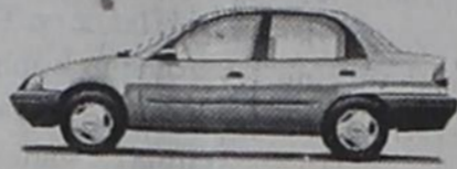
Geo Metro Sedan

On 1995-96 Geo Metros, Geo Prizms, and Geo 4-Door Trackers with approved credit through GMAC for up to 48 months