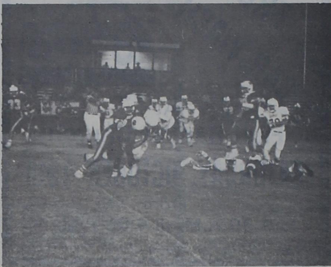
PANTHER OFFENSE STOPPED — The Panther offense was stopped short of a First Down in game action Friday against Rising Star. Come on out Friday night and cheer the Panthers on to Victory.