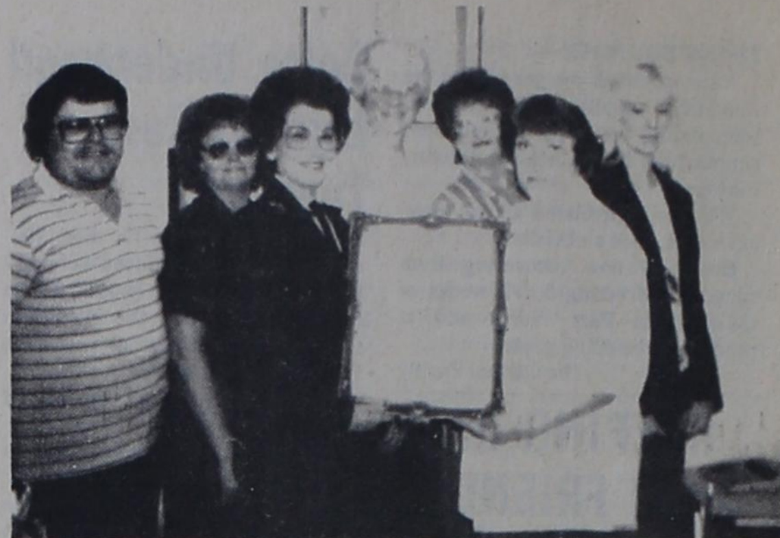
SUPERIOR FACILITY - Canterbury Villa Nursing Home of Gorman, an ICF III facility, was given a superior rating March 26, 1987, on the basis of how well it provides care and services for its residents above what is required by state and federal regulations.