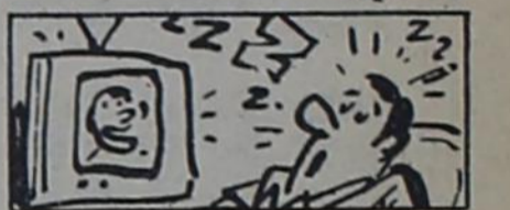
The average American watches 32 hours of TV a week.