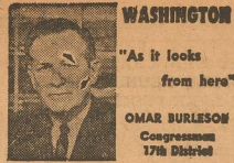
WASHINGTON "As it looks from here" OMAR BURLISON Congressman 17th District

The National First Bank GORMAN TEXAS "Oldest Bank In Eastland County"