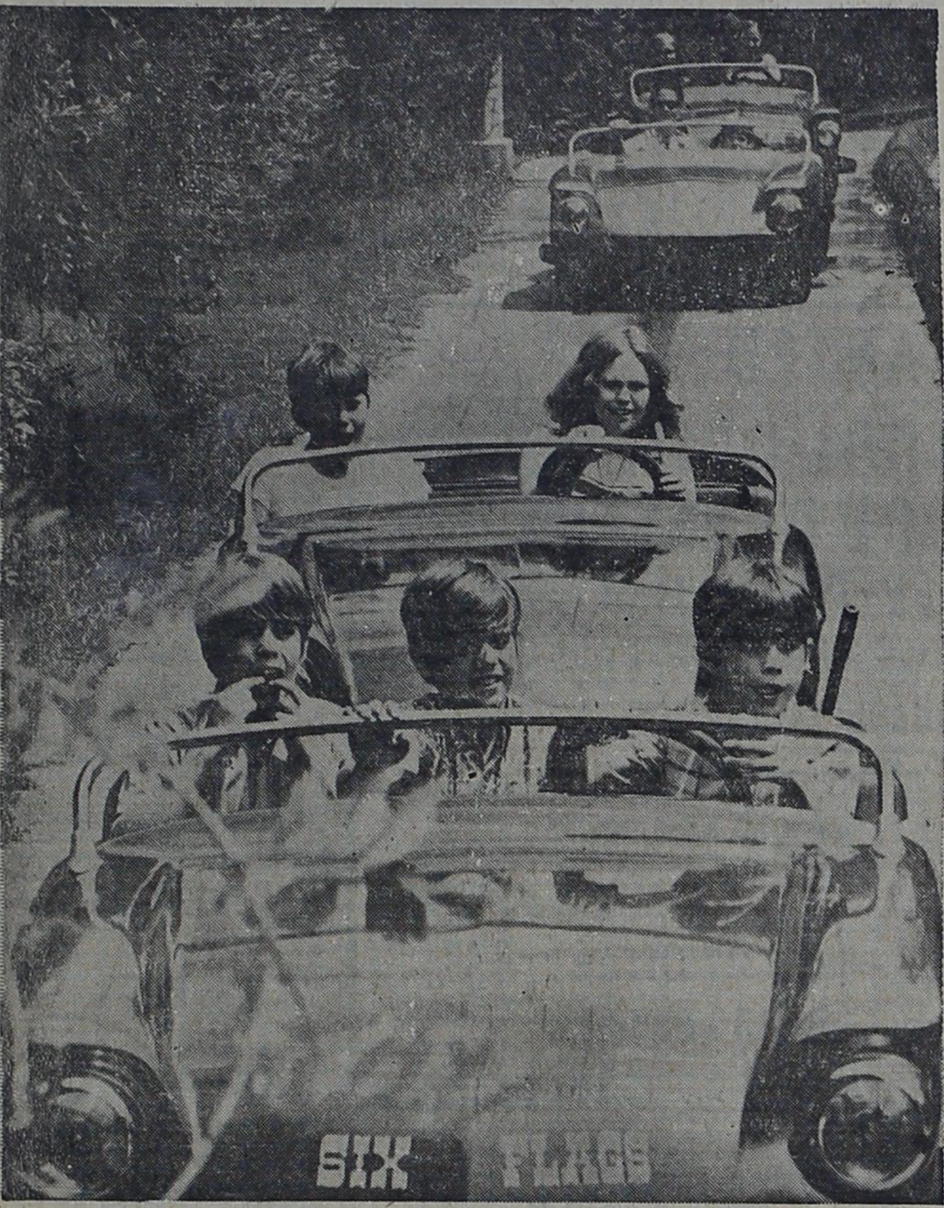
SIX FLAGS FUN —Young guests at SIX FLAGS Over Texas take the wheels of their own miniature sports cars for a fun-filled drive around the theme park's Happy Motoring Freeway. The ride is one of many which dot the beautifully landscaped grounds of the 145-acre entertainment center. Since its opening in 1961, the big theme park has played host to more than 18,000,000 visitors from throughout the world. It now provides adventure and fun for some two million persons each season.