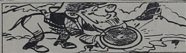
The first gold west of the Mississippi was discovered in New Mexico in 1833.