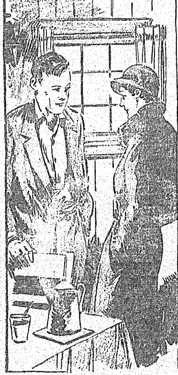
"Maybe We Can Have Lunch at the Tea Shop.'

It was grand to be clean again, even if her clothes were tired and wrinkled. She felt quite herself as she made the rounds of the various