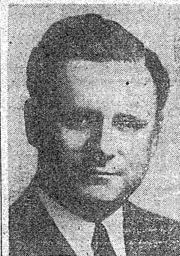
Price Daniel, U. S. Senate