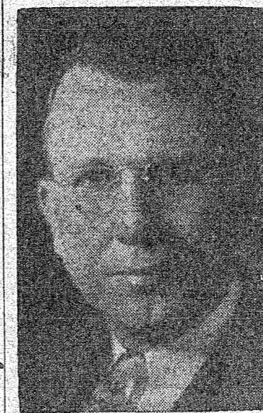
Congressman O. C. Fisher