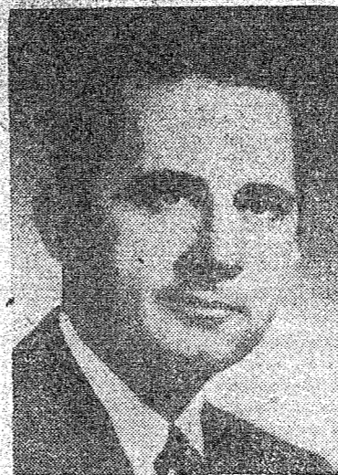
Governor Allan Shivers