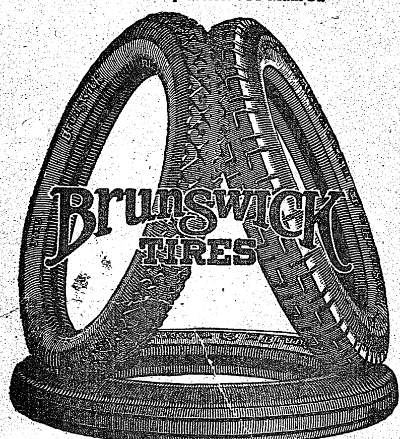
Sold On An Unlimited Mileage Guarantee Basis

THE BRUNSWICK-BALKE-COLLENDER CO. Dallas Headquarters: 611 Main St.