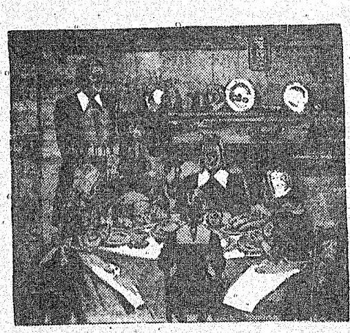
The Pilgrims gave thanks for the American Way of Life that they created, protected. and nourished into greatness.