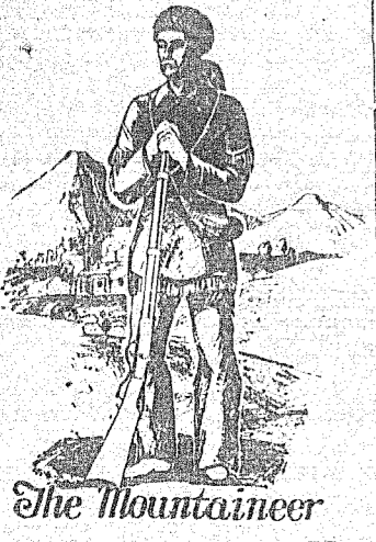
The Mountaineer MOUNTAINEER STAFF

THE OFFICIAL ORGAN OF THE STUDENT BODY OF THE SANTA ANNA PUBLIC SCHOOLS.