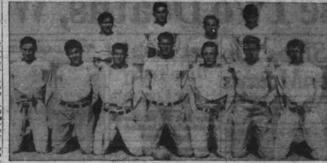
Divided into teams labeled as Stanford Indians and Texas Christian University Horned Frogs, the Big Spring high school Steers will tangle in an intra-squad football game at Steer stadium tonight 8 o'clock. No admission will be charged.