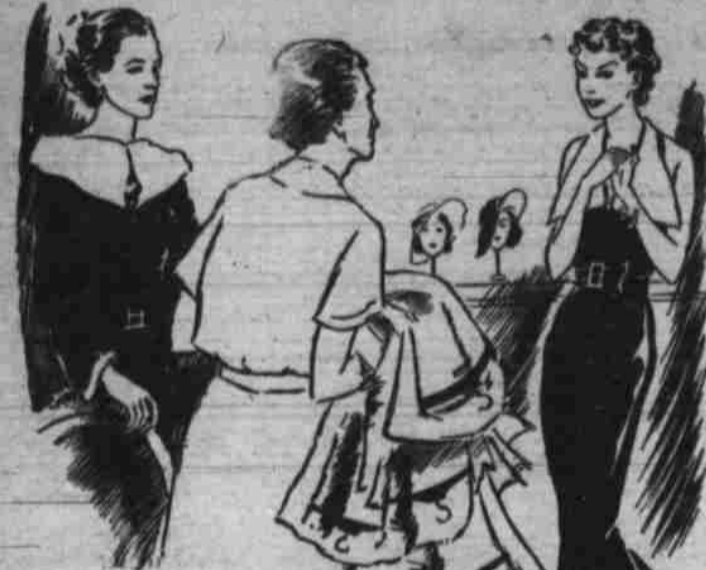
For three hours, Aunt Phina bought things.

Chapter 13 CLOTHES! Iris seemed to herself the only one who knew the difference. Aunt Ella sat in her usual dream; Uncle William of course had a tray, ate with relish and praised the food; Morgan was a little quieter than usual. So was Iris; she was inclined to think he had interfered. Anyway he saw things so queerly; he acted as if Owen were trying to steal her. Uncle William, with an invalid's interest in everything, had to hear all about the visit, so they had to seem, at least, to have made up.