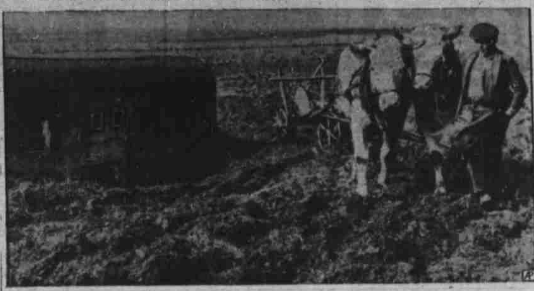
Near Strasbourg, where French and German soldiers again face each other on the Rhine, this French plowboy guides his ox team past an old German "pill box." The fields hereabouts still yield thousands of "duds" from the World war.

Paris, April 14 (UP)—While French and German soldiers glow at each other across their respective frontiers, France's shell reclamation mission, serenely goes along, excavating unexploded shells from the battlefields of the last war where 4,000,000 men lost their lives. Farmers plowing in the shadow of the great Maginot line of steel-and-concrete frontier fortifications between Belgium and Switzerland, still come across unexploded shells, grenades and bombs. Tons of "Duds" Salvaged Eighteen years after the armistice, requests still stream into the war ministry from the devastated regions that explosives found in the fields be carried away. The war ministry reports that from January, 1920 to January, 1936, there were 4,320 such demands, that 1,450,000 tons of high explosives were removed and 167,000 tons—too dangerous to displace—were destroyed on the spot. After the war, the ministry of