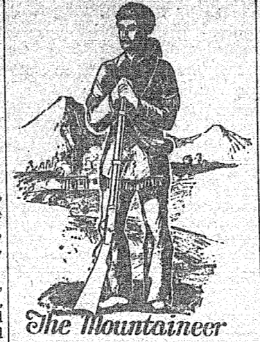
The Mountaineer Band Officers Elected Monday

Santa Anna Loses - - (continued from page one) third quarter; 3, fourth quarter. Santa Anna was penalized 55 yards and Cross Plains 70 yds.