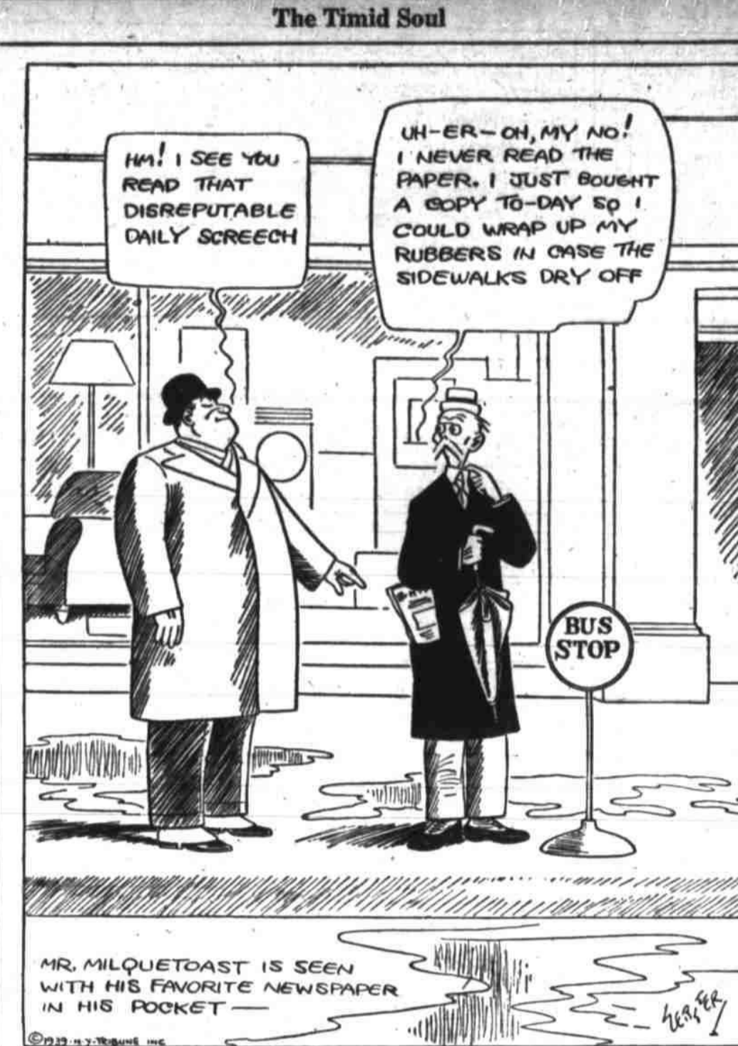
MR. MILQUETOAST IS SEEN WITH HIS FAVORITE NEWSPAPER IN HIS POCKET