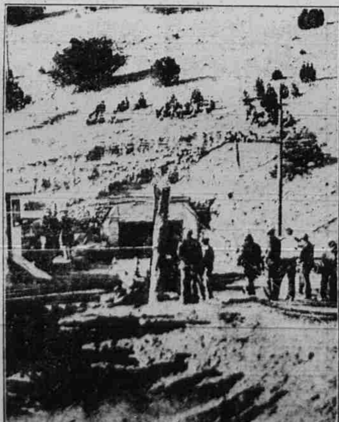
The above picture was taken as wives, relatives and fellow workmen gathered at the mouth of the Albuquerque-Corrillo Coal company mine at Madrid, N. M., to learn the fate of 14 miners engulfed by an explosion. All were found dead.