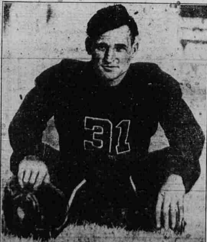
Pepper Martin, speedy outfielder of the St. Louis Cardinals, has added another niche to his personal hall of fame. Participating in a football game with an Oklahoma City team, he played long enough to score a touchdown, making 34 yards in three tries.