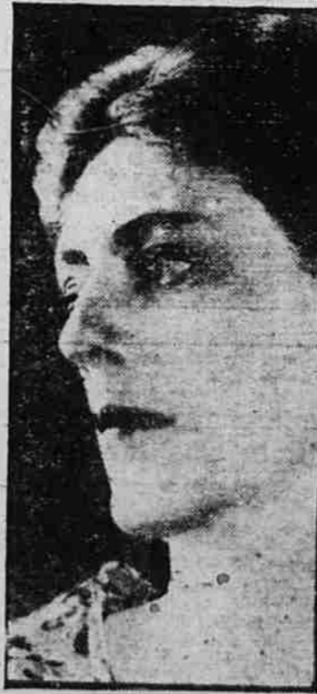
Ethel Barrymore, first lady of the American theater, is ill in New York with pneumonia. She is expected to be inactive for several weeks.