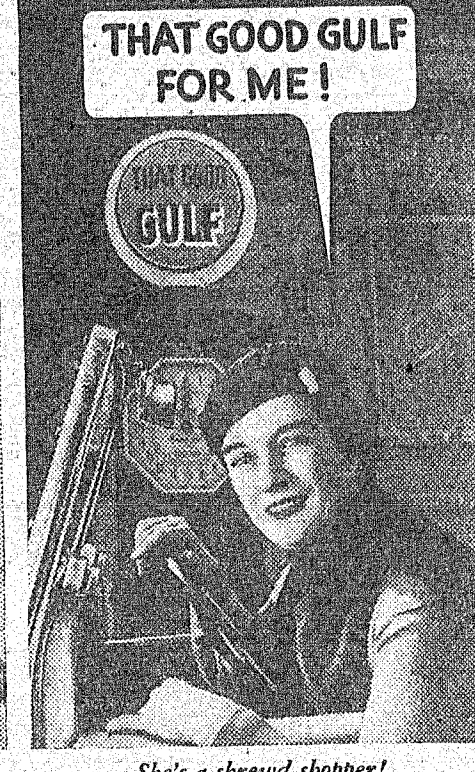
She's a shrewd shopper!