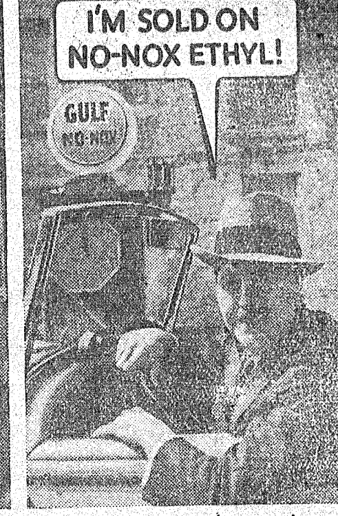
He'll pay more and get more!