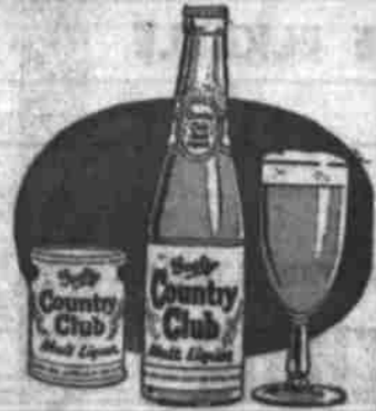
B. E. GOETZ BREWING COMPANY ST. JOSEPH—KANSAS CITY, MO.

Heighten your hospitality with today's smartest taste discovery—Country Club Malt Liquor! Your guests will enjoy its smooth luxury taste—you will, too. And you'll appreciate its very moderate price! Try it today, sure!