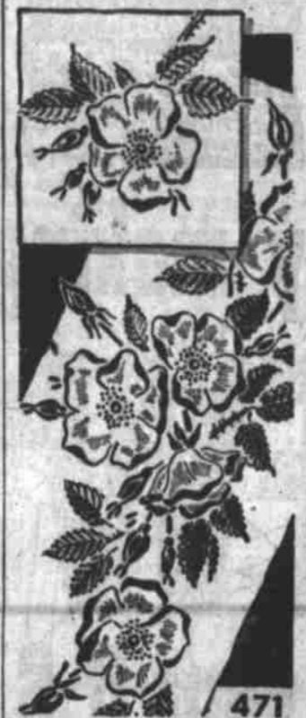
Country Lane Roses