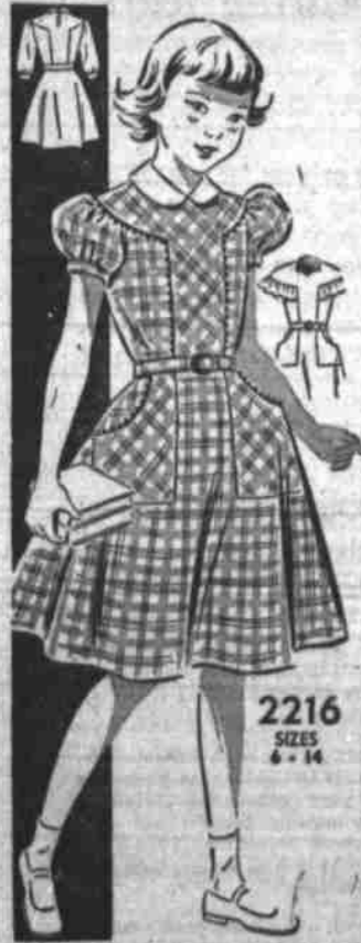
2216 SIZES 6-14