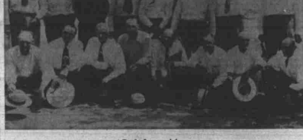
Twenty World War I veterans gathered in City Park Sunday for the annual reunion of Company D, 117th Supply Train. The unit was made of men from Big Spring and surrounding area and was part of the 42nd (Rainbow) Division.