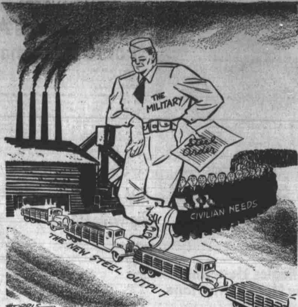
After Him You're First

Reception Opens 16th XIT Reunion DALHART, Aug. 11 (AP)—The 16th annual XIT Reunion opened last night with a public reception honoring members of the XIT Association. The association is made up of men who once rode for the three million-acre XIT Ranch from 1885 to 1912 and their families.