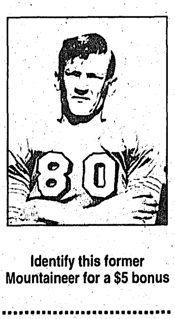
Identify this former Mountaineer for a $5 bonus

7) Winners will be announced each week in the Santa Anna News, and may come by the office to claim their prize. Out of town winners will receive prizes through the mail.