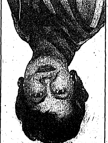
Dorothy Dillingham To Be Honored With 80th Birthday Celebration

I never travel without my diary. One should always have something sensational to read.