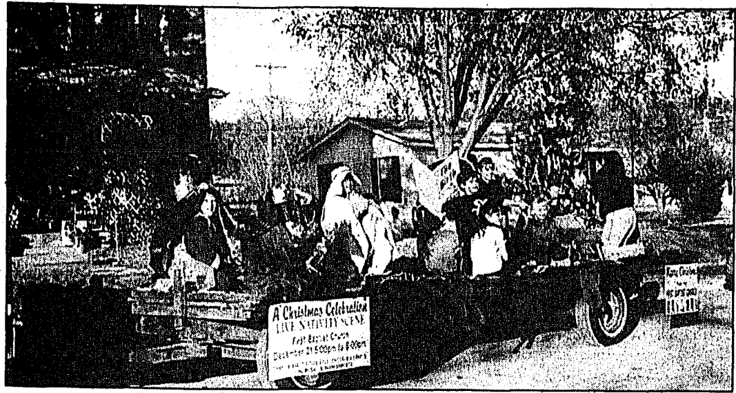
GA's and RA's of First Baptist Church were first place winners in the Christmas Parade.