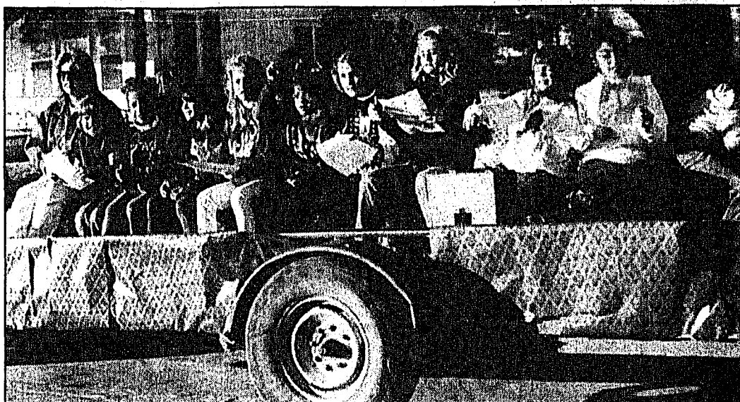
Santa Anna Girls Scouts were third place winners in the Christmas Parade.