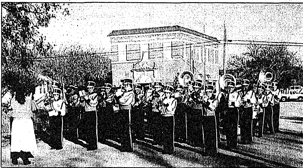
The Santa Anna High School Marching Band received Honorable Mention in the Christmas Parade.

The Noah Project-Central is also in need of "offier" items. Some of the items needed are bean bag chairs; porta-cribs; 31" mini-blinds; sewing machine; overhead projector; iron, vacuum cleaner; pet supplies; diapers (all sizes); children's underwear and socks (all sizes); ladies underwear (all sizes); any personal items or toiletries; kitchen