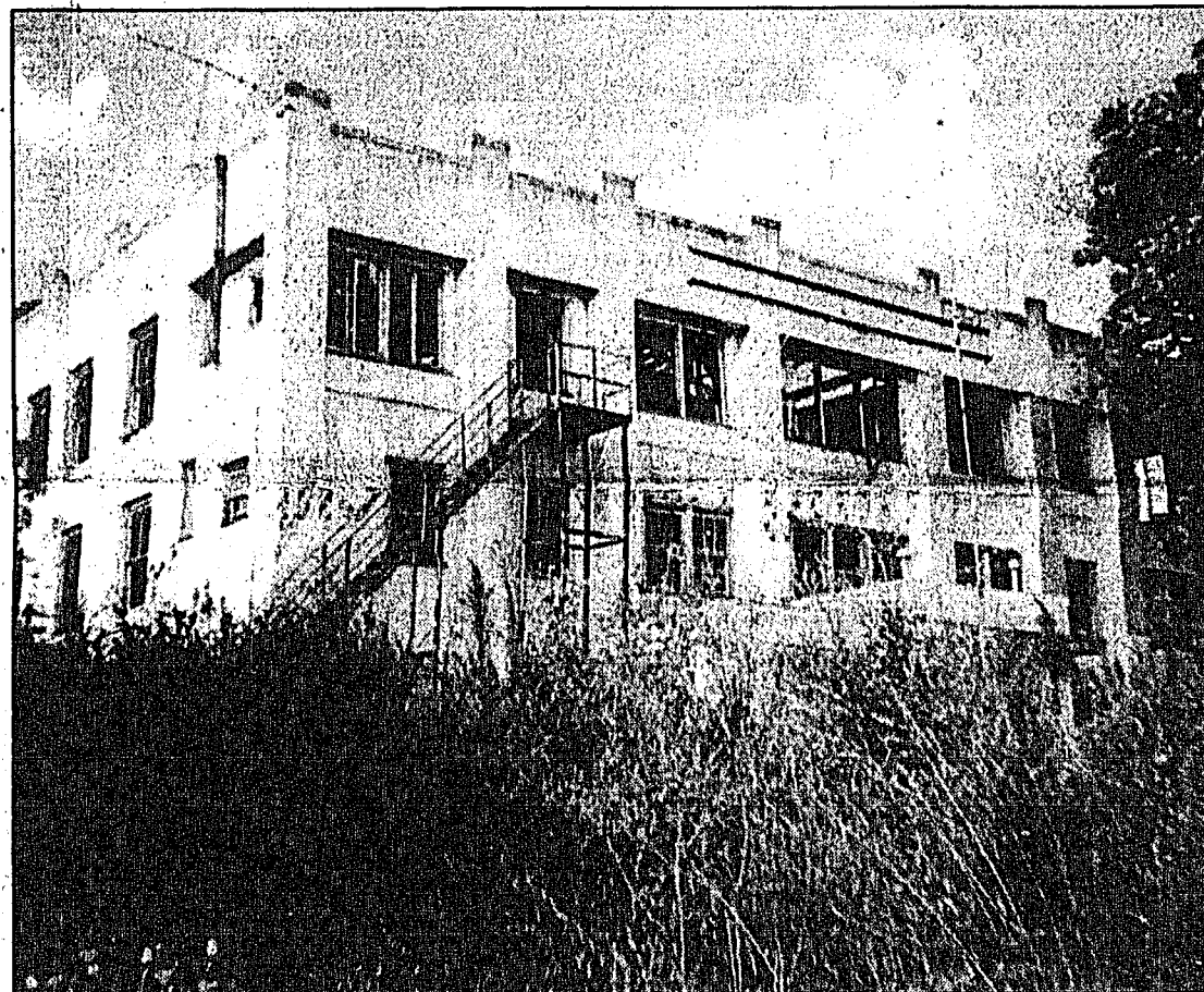
The HDO recommends demolition of Sealy Hospital bldg. after an engineer has advised against trying to restore it. What do you think? Let the HDO know how you feel about it.

The HDO is also making plans to sponsor the second annual Frontier Heritage Festival and World Championship Bison Cook-off. October 11 is the date set for the event which brought a large number of visitors to our town last year. Activities discussed for the festival included the return of the Cavalry unit, Comanche Indians, Crafts concerning the old west, Western, Art and food booths. Discussion of the festival will continue at the next meeting set for July 14.