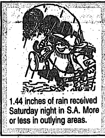
1.44 inches of rain received Saturday night in S.A. More or less in outlying areas.

Tenure is a status that is awarded to those who show excellence in teaching and research. A tenured