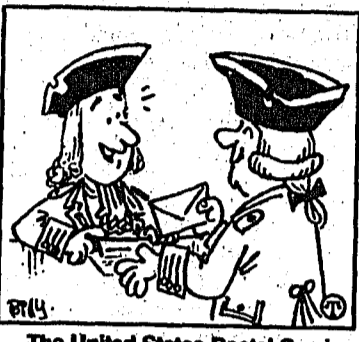
The United States Postal Service dates back to the Revolutionary War era when Benjamin Franklin was the first postmaster general.

***** Doctors say prolonged exposure to noises over 90 decibels can lead to hearing loss. A typical rock concert is about 100 decibels, a jet engine 800 feet away around 110. *****