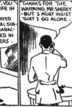
ARE TAKING YOUR LIFE IN YOUR HANDS! IT HAS BEEN REPORTED TO ME THAT SEVERAL SU PICIOUS LOOKING CHARAC-TERS HAVE ARRIVED IN TOWN - NEW COMERS