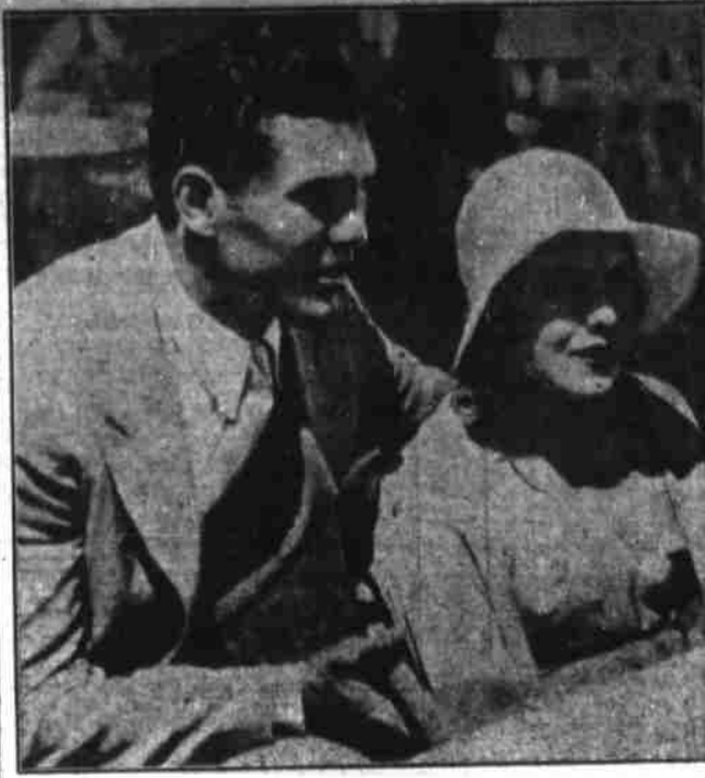
Max Schmeling, dethroned heavyweight champion, is shown with his bride, Ann Ondra, at Helligendam, Baltic summer resort, where they spent their honeymoon.