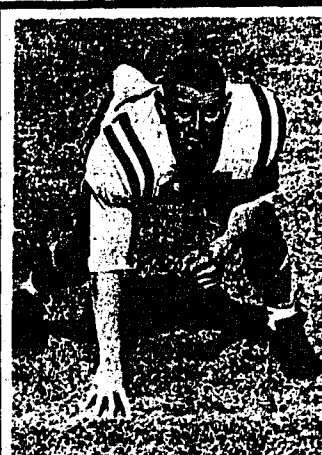
Identify this former Mountaineer for a $5 bonus

1) A game is found in each of the sponsoring ads on this page. Indicate your pick by writing the name of the team on the line adjoining that advertiser's name. 2) $15 will be awarded to the person picking the most games correctly. In the event of a tie, the tiebreaker will determine the winner, (winning team and total combined points scored in game). 3) A $5 bonus will be awarded to the contest winner if he/she also identifies the former MOUNTAINEER correctly. 4) All decisions by the judges are final. 5) Employees of Santa Anna News are not eligible. 6) Mail, FAX, or bring your entry to the Santa Anna News, 609 Wallis, P.O. Box 399, Santa Anna, TX 76878. FAX-915-348-3545. Entries must be received by 5:00 p.m. Friday for that week's contest. Mailed entries will be accepted Monday if they show a postmark of no later than 5:00 p.m. Friday. The NEWS will not be responsible for late arriving mail. 7) Winners will be announced each week in the Santa Anna News, and may come by the office to claim their prize. Out of town winners will receive prizes through the mail.