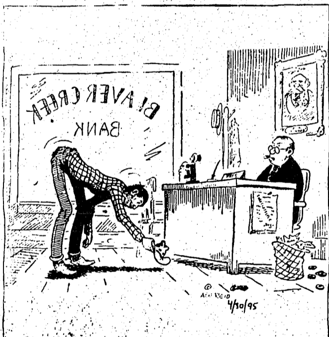
"Well, I see you're tryin' fer another loan."