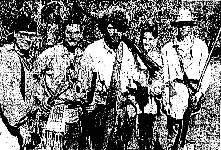
These gentlemen came from all over the state to participate in the "Rendezvous 1995" held recently at Hords Creek Lake.