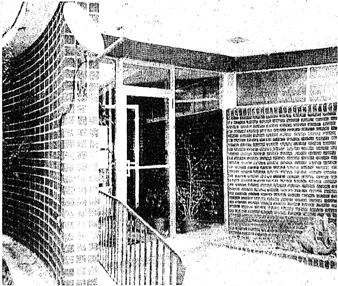
The first 18-inch satellite dish received a couple of weeks ago was installed at the Santa Anna Telephone Cooperative office. Coleman County Broadcasting Systems is a subsidiary of the Telephone Cooperative.