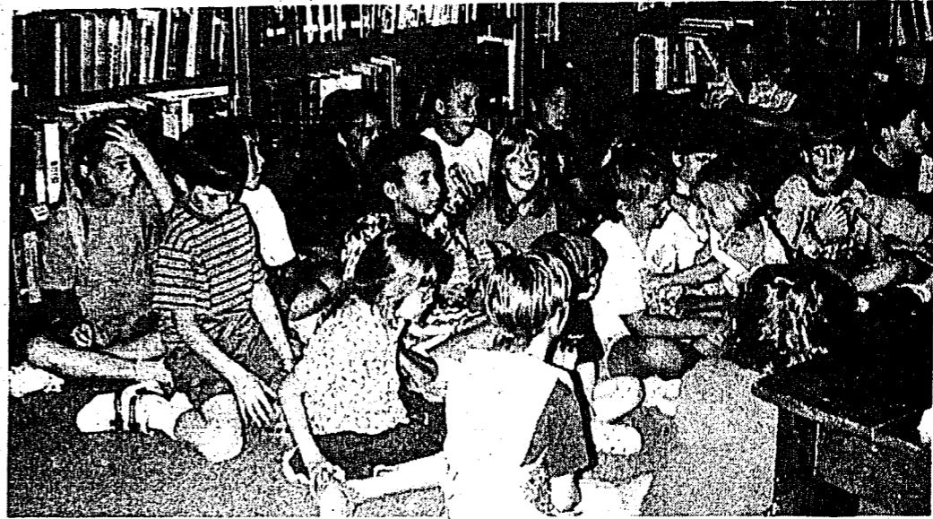
Eager reading club members waited patiently while the winner of the two tickets to Six Flags of Texas were drawn during the meeting.