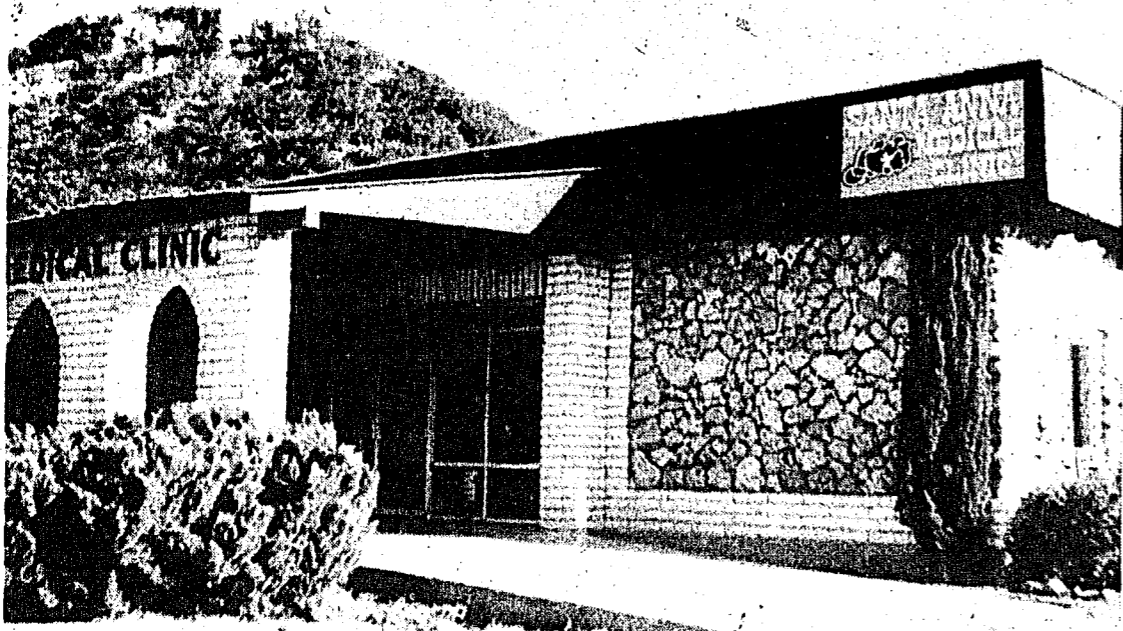
Santa Anna Medical Clinic is located in the former Cabansag Medical Clinic near Ranger Park Inn