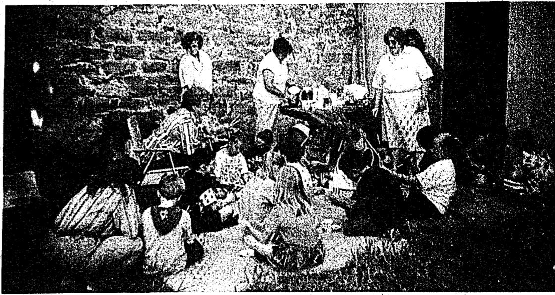
Santa Anna Library Reading club members pictured above enjoyed eating rice with chop sticks, mandarin orange, fortune cookies and tea during the last meeting of the year.