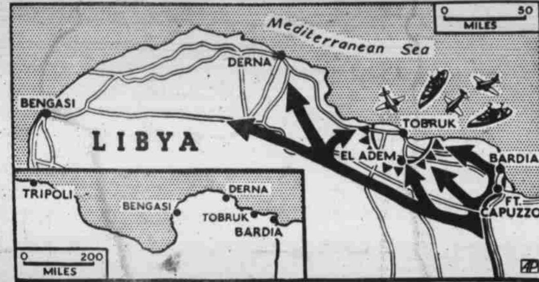
BRITISH PUT ON SPEED AND POWER IN THE DESERT—The British, with Bardia in their hands, hammered at the defenses of Tobruk and British military circles said that the speed and power of their mechanized cavalry made the situation precarious for Marshal Graziani's troops unless they began a retreat toward Benghazi immediately. The British occupied Tobruk's airport, El Adem, and thrust at other points in the 75-mile defense circle ringing Tobruk as the navy and the R.A.F. pounded at the fort from the sea and in the air. The advance took British columns toward Derna and along the road toward Benghazi. The British claimed the road west of Tobruk was commanded by their patrols. Inset shows the area from Bardia to Tripoli. The R.A.F. bombed Tripoli, the Rome communique said, killing four and injuring 10.