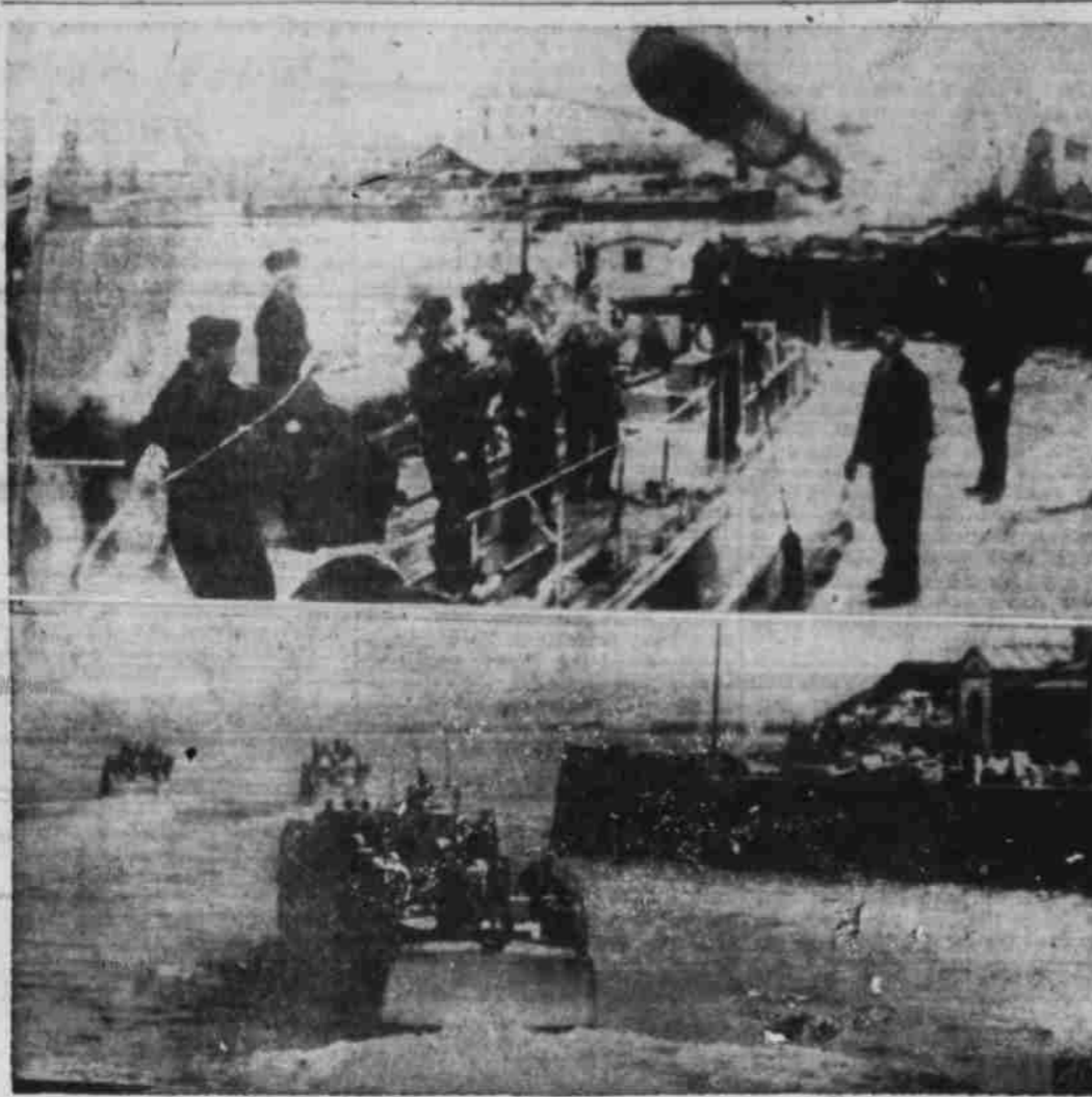
NAZI MOSQUITO BOAT LOADS, SPEEDS OFF TO HARASS BRITISH — A Nazi speedboat (top photo), one of the fleet of small but deadly "mosquito boats," loads a torpedo on an unnamed port for an attack against British ships in the English channel. In the lower photo, a fleet of the torpedo-carrying boats, their motors thundering, moves away from the home base to wage war on enemy warships and merchant shipping. Bulkhead at right appears to be damaged.