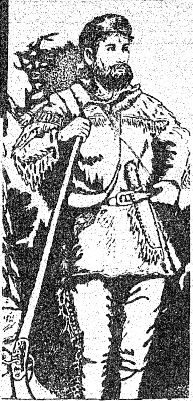
Gold Fever-Catch It!